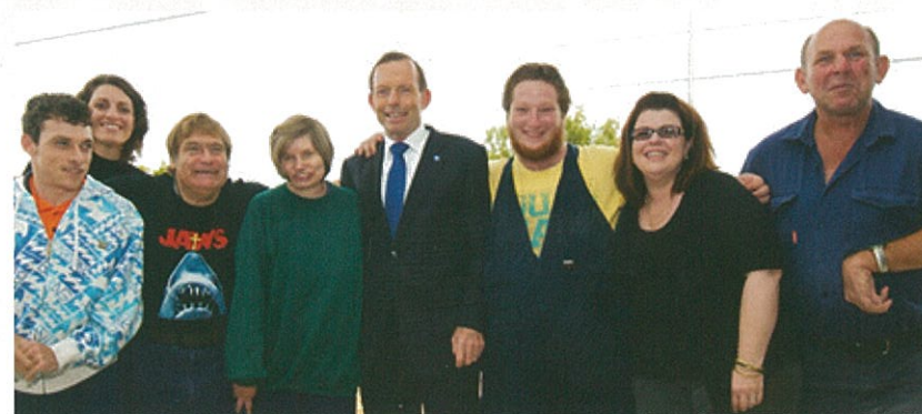
Prime Minister Tony Abbott with employees and staff of Create Employment and Goodwill Engineering